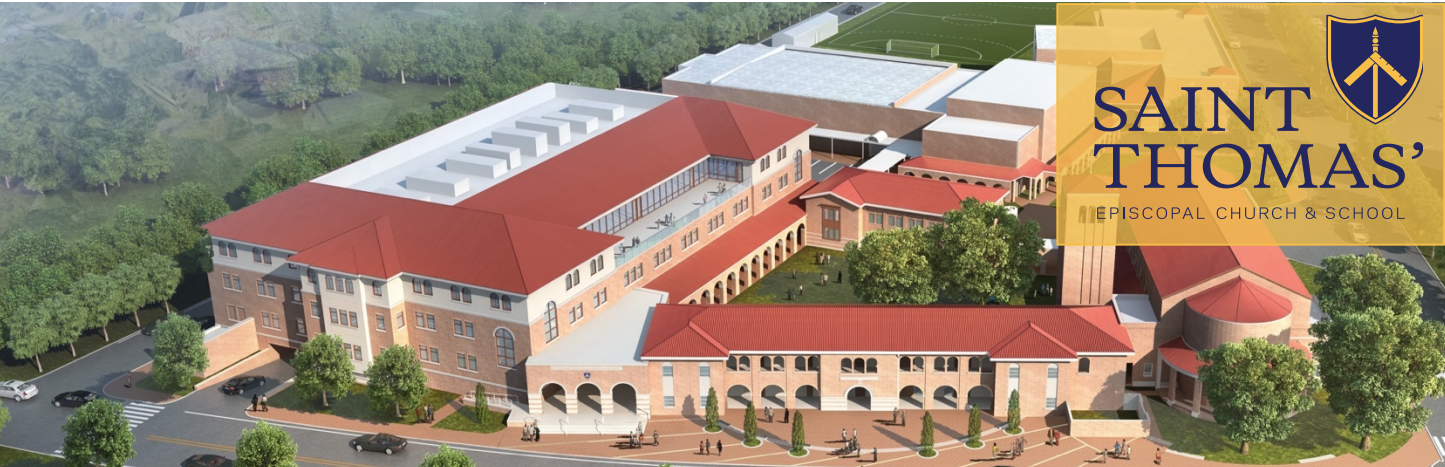
FULFILLING THE PROMISE. A Vision for Saint Thomas' Episcopal Church & School